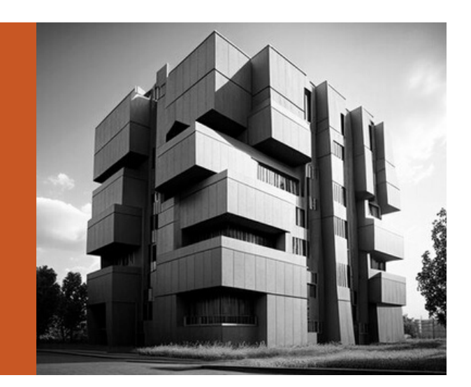
Future Zen Consultants (FZC) LLP is an India based Business Advisory, Project Management Consulting (PMC) and Lump Sum Turn Key (LSTK) firm providing Concept to Market (C2M) solutions for the diversified industries across locations

FZC adds value to the business of the organizations by providing Project related Innovation and Manufacturing Solutions as a Project Management Consultant